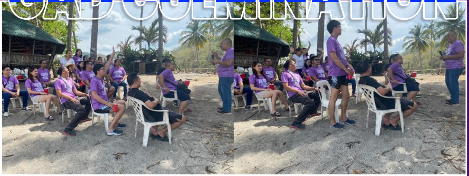
(Above) The NFSTI has closed the Women's Month Celebration which coincides with the Institutional Strengthening Activities held at Puerto Azul in Cavite. The staff commits themselves that women empowerment will not be commenced during March only but as a whole year activity. (Below) With the commitment of NFSTI to the holistic approach to training, the NFSTI provides twice a week of physical development to the staff and CRIDEC students to maintain their physical health and vent out their stress and tension through dancing.