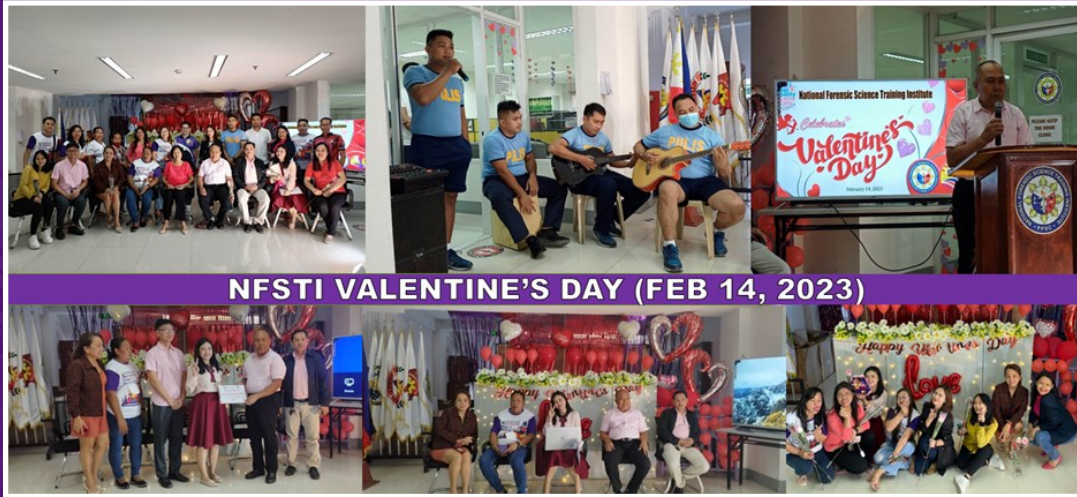
NFSTI VALENTINE'S DAY (FEB 14, 2023)

Valentine's Day is celebrated in most countries. Different cultures have developed their own traditions for this festival. In some parts of the world, Valentine's Day is observed as a day for expressing love between family members and friends, rather than that of romantic couples. NFSTI take this opportunity to show appreciation especially to NFSTI's female personnel to uplift office morale and for them to feel that the Institute cares and recognizes their importance as a women. This occasion has the