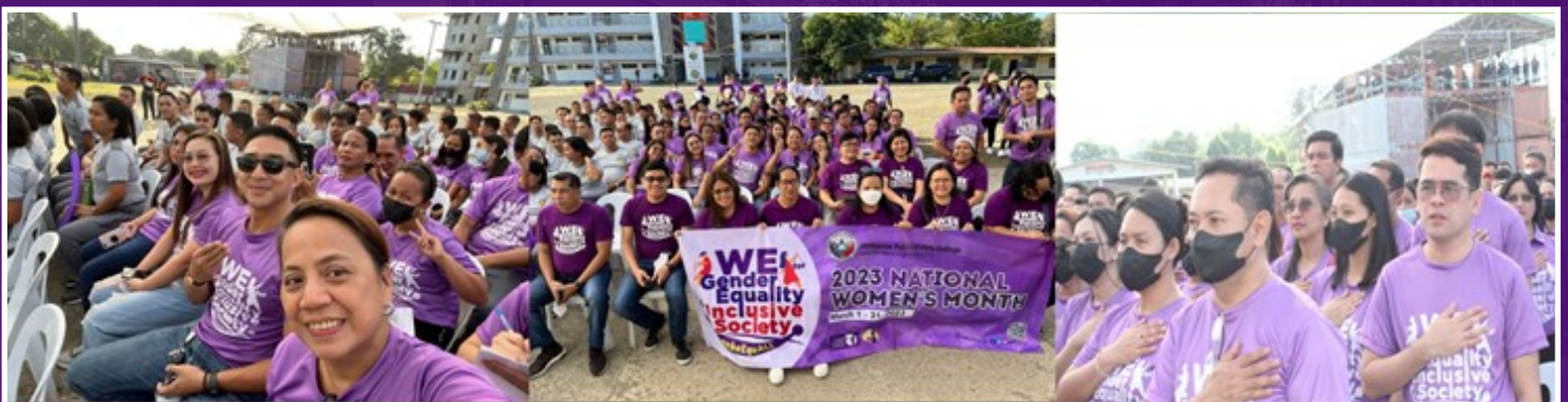
Joint Kick-Off National Women's Month @NFSTI (March 7, 2023)

In observance of 2023 National Women's Month Celebration, the NFSTI joins the annual celebration dated from March 1-31, 2023 and subsequently serves as a venue to feature women's achievements and discuss continuing and emerging women empowerment and gender equality issues and concerns, challenges and commitments. The celebration aims to highlight the empowerment of women as active contributors to and claimholders of development.